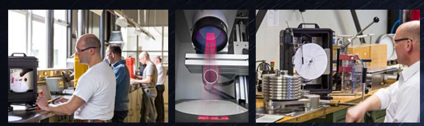
TEMPERATURE CALIBRATION -200/600°C (-328/1100°F)