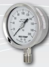
All Welded SS