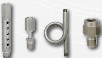
Cooling Towers Siphons Snubbers