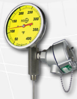
Dual Mode Thermometer