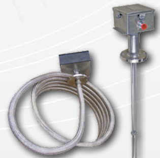
Thermocouple or RTD