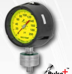
MS8 Seal Gauge