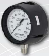
Solid Front, Blow-out Back